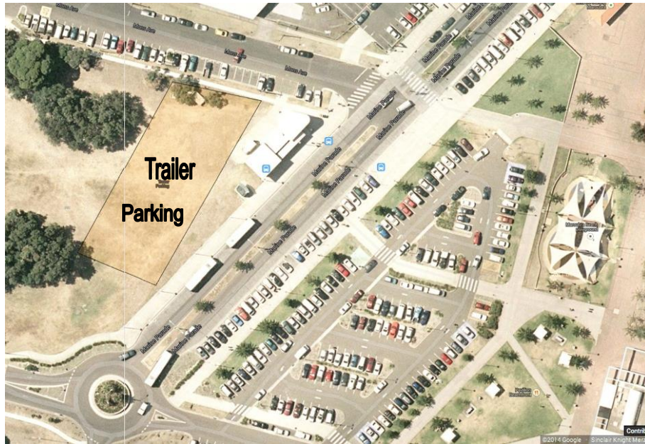
Map 1.2 - Craft trailer parking area, Broad Arrow Reserve