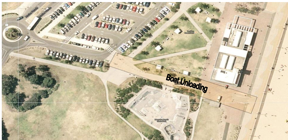
Map 1.3 - Surf Boat unloading area.

The same procedure applies for when picking up your surf boat at the conclusion of the competition