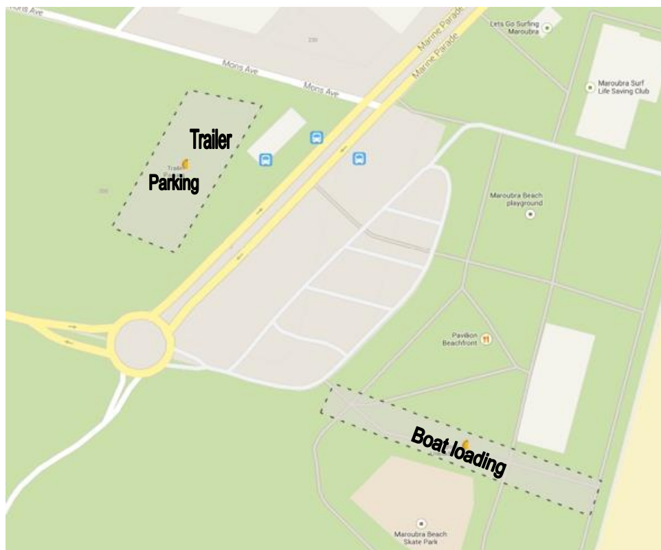
Map 1.1 - Maroubra Beach Trailer Unload Points.

Once parked you will be able to unload your trailer, and using the pedestrian crossings cross Mons Avenue initially and then Marine Parade. There will be a marshal on hand during each morning to help stop traffic at reasonable intervals to allow for safe crossing of competitors with craft to the beach.