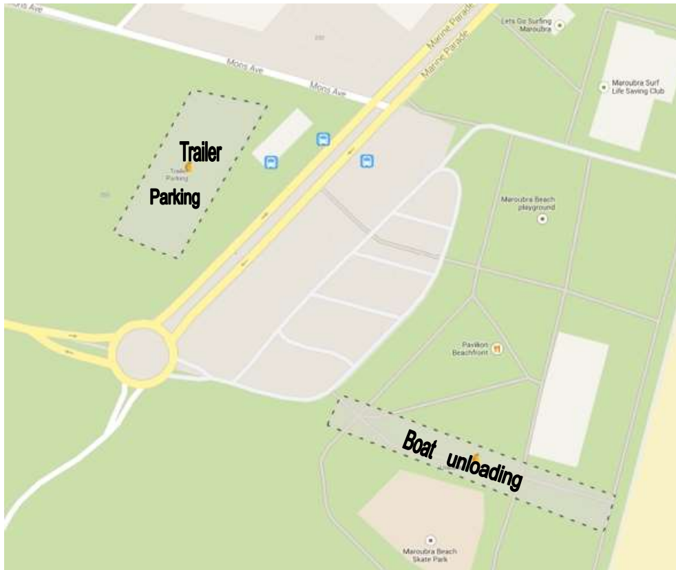
Map 1.1 - Maroubra Beach Trailer Unload Points