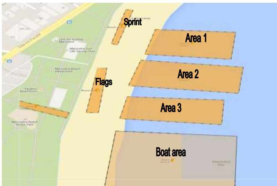
Map 1.4 - Beach Layout

Water Area 4 - Swimming only (no boards)