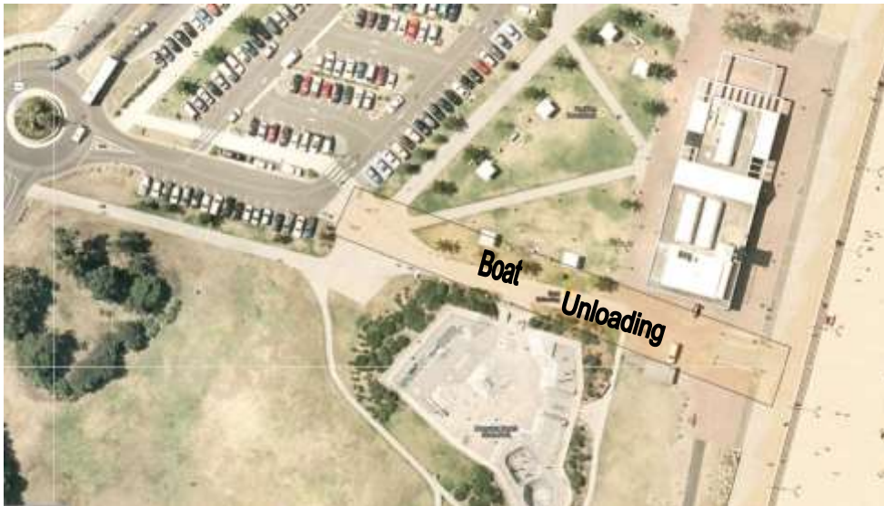
Map 1.3 - Surf Boat unloading area.

Once you have unloaded your trailer please proceed to the craft trailer unloading and trailer parking area on Mons Avenue. There will be a designated parking area available for your trailer. The same procedure applies for when picking up your surf boat at the conclusion of the competition.