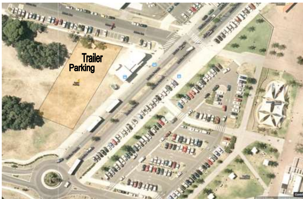
Map 1.2 - Craft trailer parking area, Broad Arrow Reserve