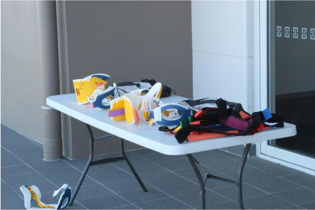
DO NOT PRESENT LIKE THIS!