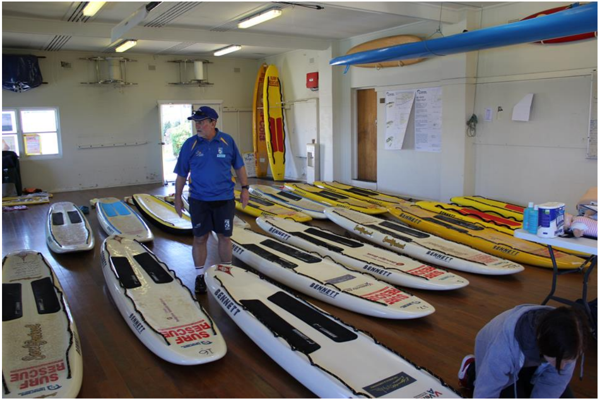
NOT LIKE THIS! Trip hazard, not sequential, confined space