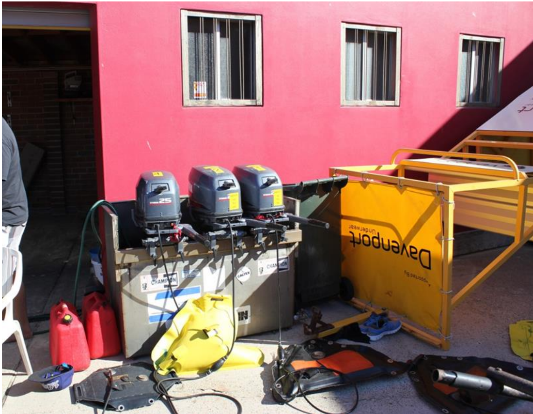
DO NOT PRESENT LIKE THIS!