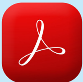
Adobe Acrobat Reader