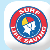
SLS Beachsafe App