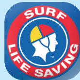
SLSA Operations App