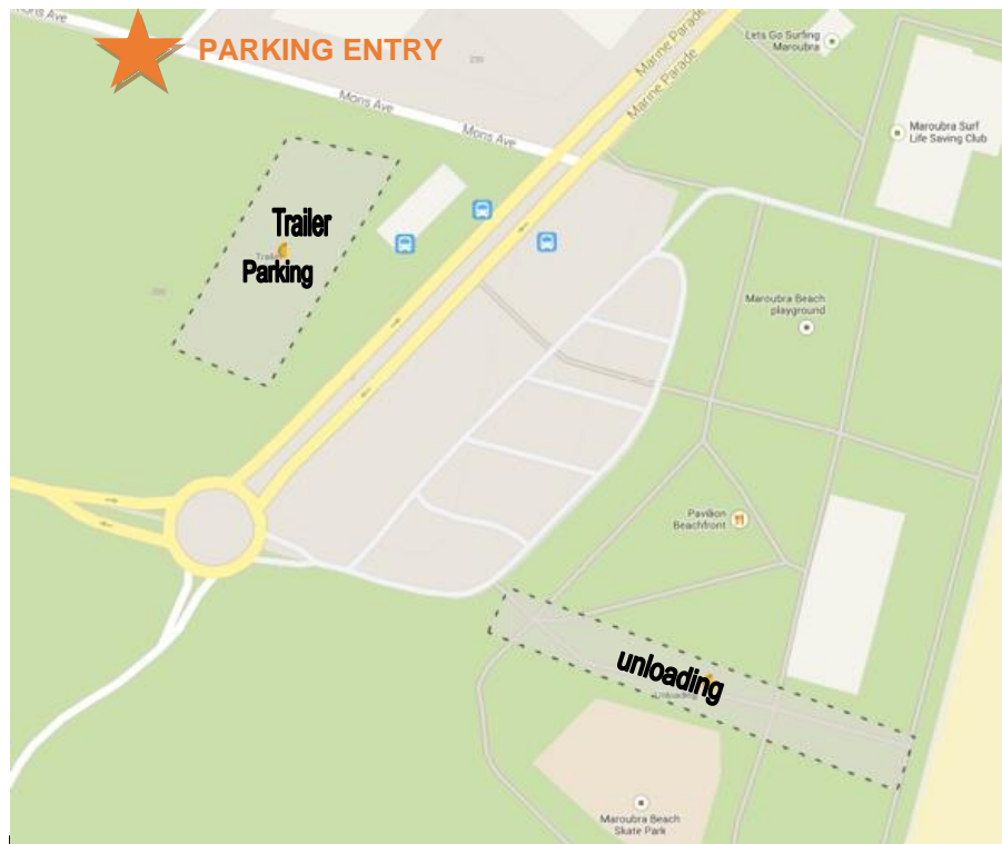
Map 1.1 - Maroubra Beach

Once parked you will be able to unload your trailer, and using the pedestrian crossings cross Mons Avenue initially and then Marine Parade.