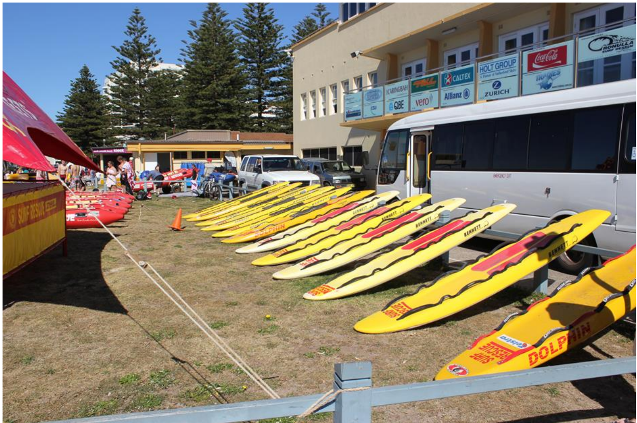
PRESENT LIKE THIS!