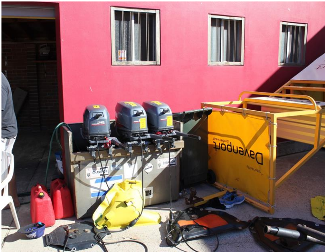
DO NOT PRESENT LIKE THIS!