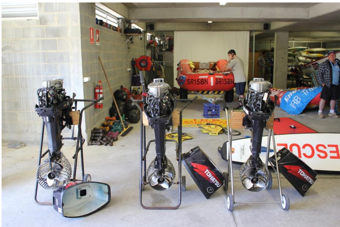
PRESENT LIKE THIS!