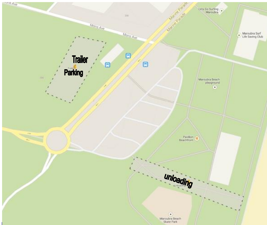
Map 1.1 - Maroubra Beach

Once parked you will be able to unload your trailer, and using the pedestrian crossings cross Mons Avenue initially and then Marine Parade.