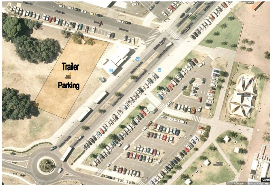
Map 1.2 - Craft trailer parking area, Broad Arrow Reserve