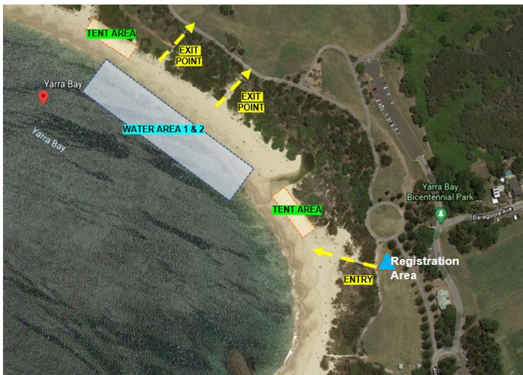
Map 1.5 – CONTINGENCY carnival layout – Yarra Bay

N.B. No beach events will be moved and no contingency location is planned for Masters Program Sunday 7 February.