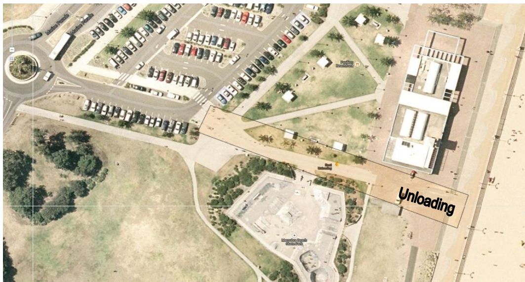
Map 1.3 - IRB unloading area

IRBs rostered for the weekend are to arrive at Maroubra SLSC at their designated time and report to a Maroubra club representative. You will be able to access Maroubra SLSC to unload your IRB, and then you will be directed to park your trailer in the designated trailer parking area in Broad Arrow Reserve, Mons Avenue.